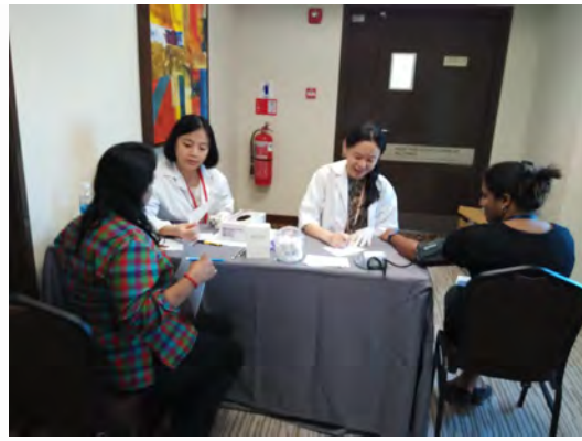
Health screenings were also provided for participants. Please refer Figure 1 .